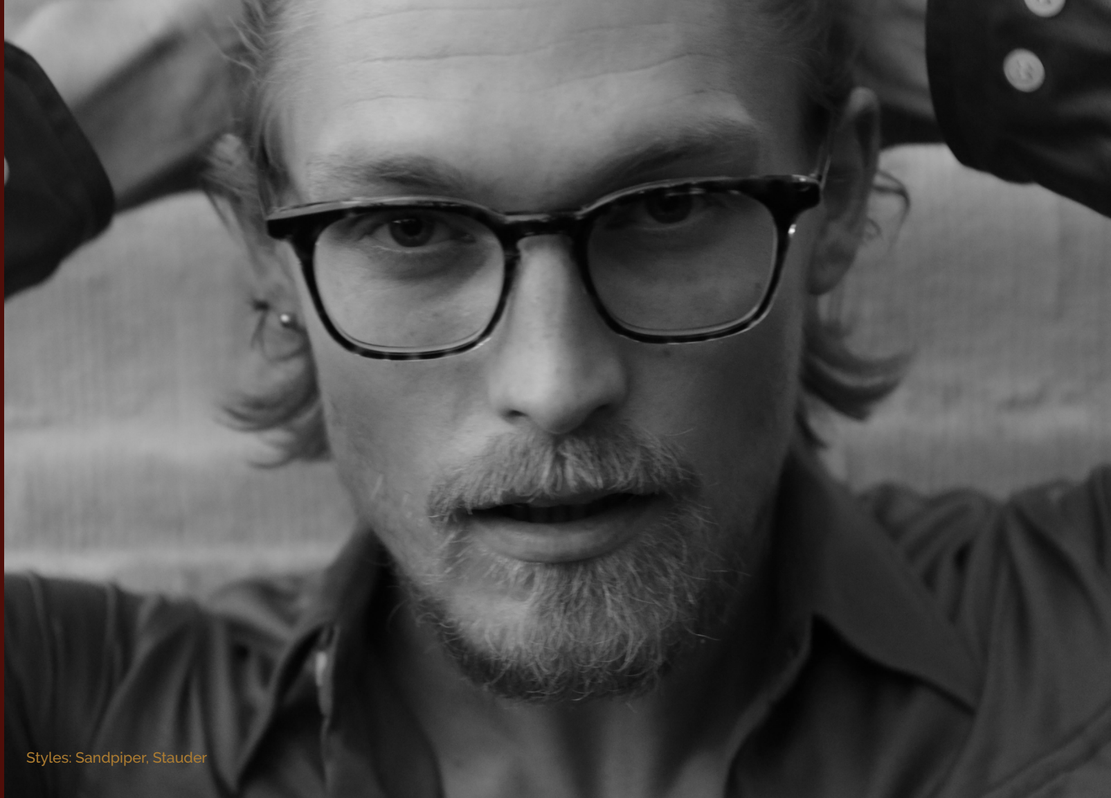
Styles: Sandpiper, Stauder