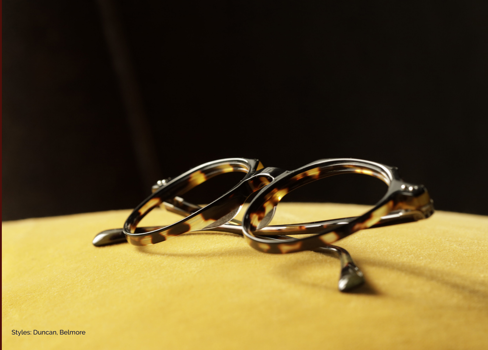
Styles: Duncan, Belmore