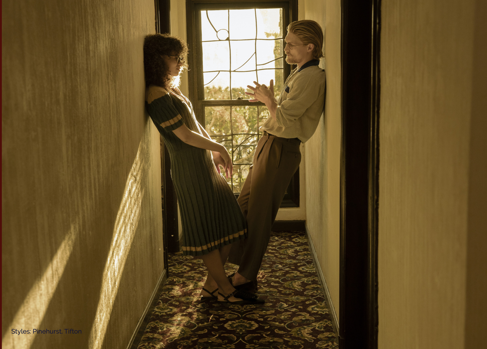
Styles: Pinehurst, Tifton