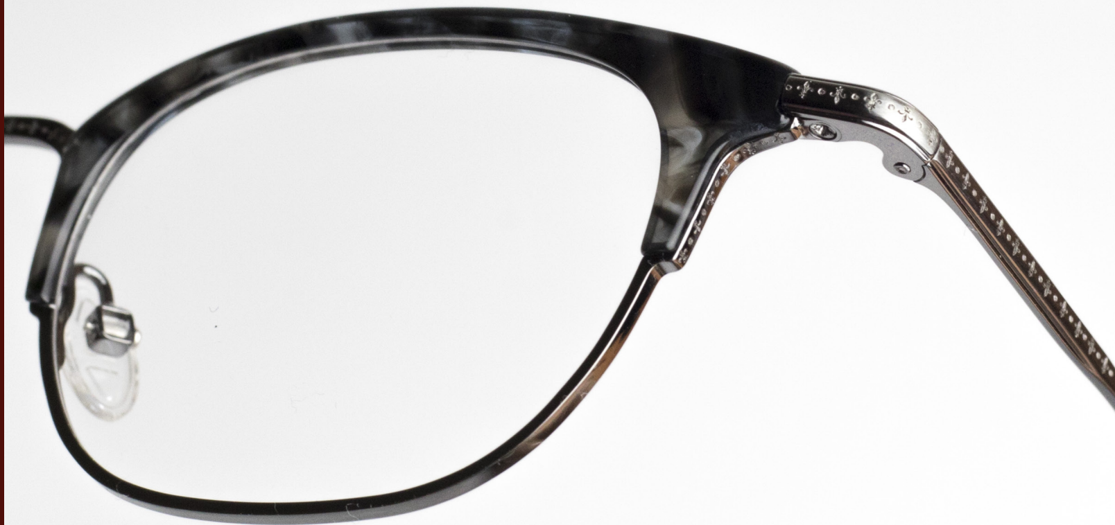
Style: Hartford Grand