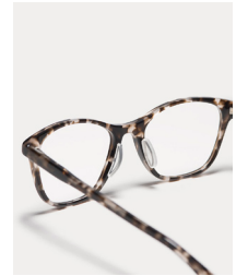
CRTO CREAM TORTOISE