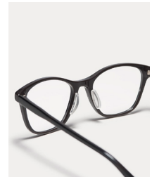
MDTO MIDNIGHT TORTOISE