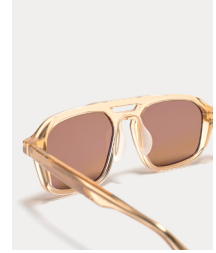
VNTCRY VINTAGE CRYSTAL