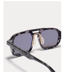
BLKM BLACK MARBLE